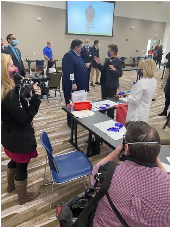
Governor Pritzker visits the iHotel and Conference Center mass vaccination site