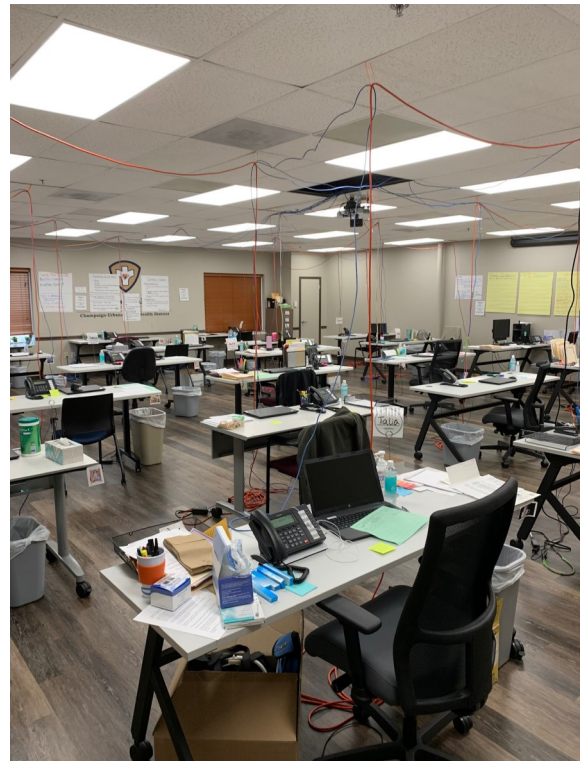
CUPHD Emergency Operations Center